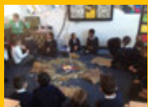
drama in Year 4.